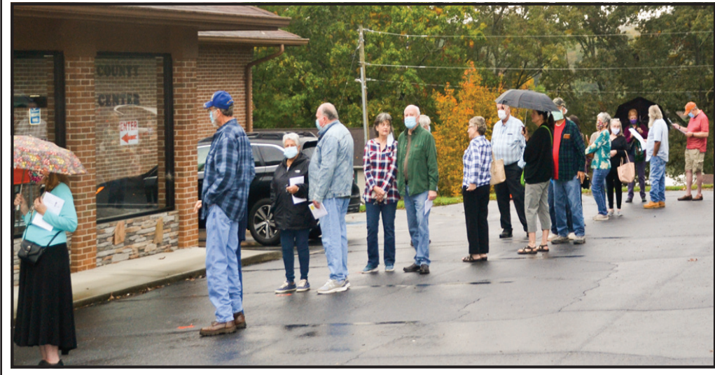
The Towns County Board of Elections welcomed a line of people at the start of early in-person voting Monday.