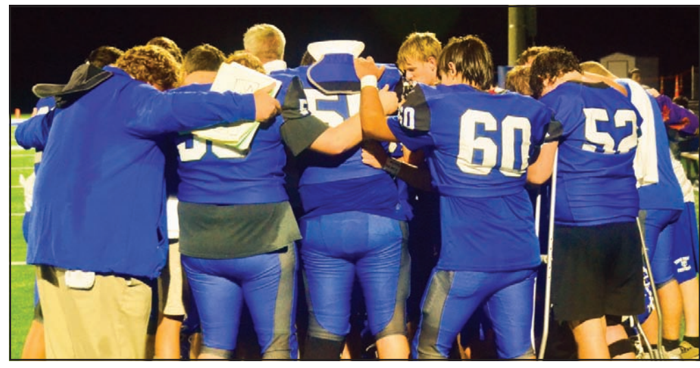
The Indians huddle during their Sept. 25 Homecoming Game. The team will miss its Oct. 16 As of Monday, Oct. 12, 44 See Indians Quarantined, Page 6A home matchup against Lincoln County due to COVID quarantine.