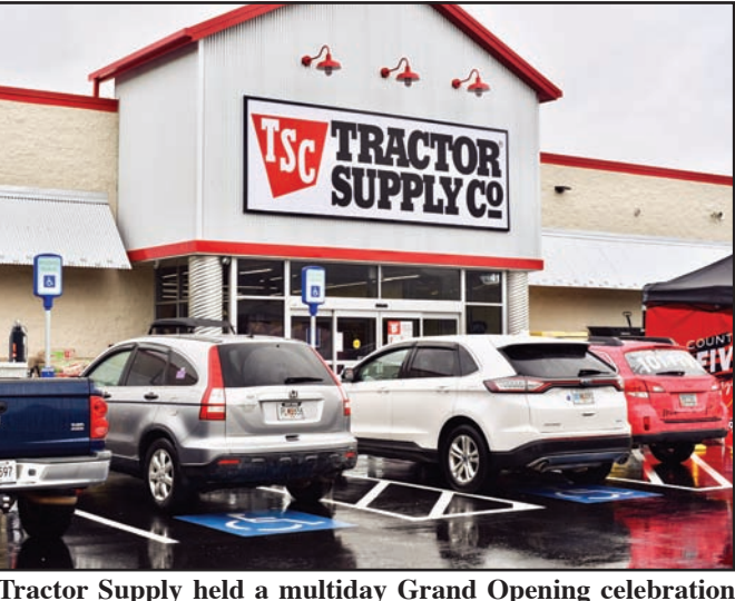
Tractor Supply held a multiday Grand Opening celebration over the weekend, which was well attended despite the rainy weather.

Supply stores located in Blue living in eastern Union County, Ridge and Murphy, North Young Harris and Towns Carolina, the new store is a welcome addition to the community, especially for those